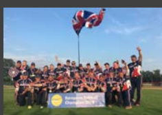
1. Great Britain