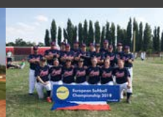
4. Czech Republic