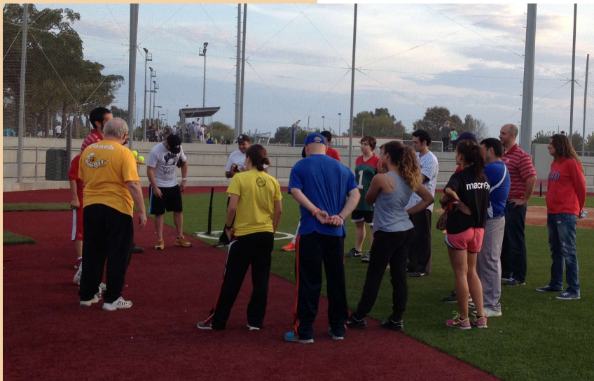
Many adult participants from all over Spain visited the two-days clinic BeeBall on the playgrounds of Barcelona. Inclusive a lot of teams with kids and... parents played BeeBall for the first time.